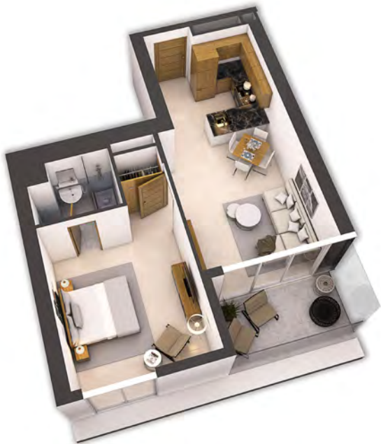
TOWER B 1 BEDROOM