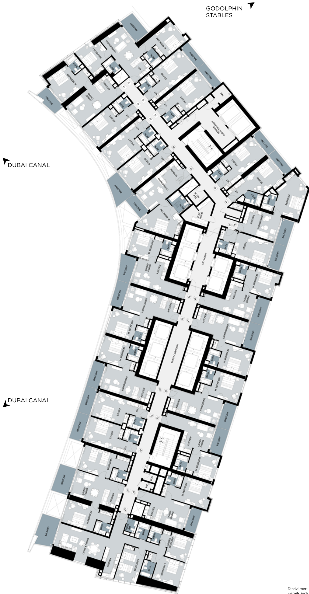
TYPICAL FLOOR PLANS