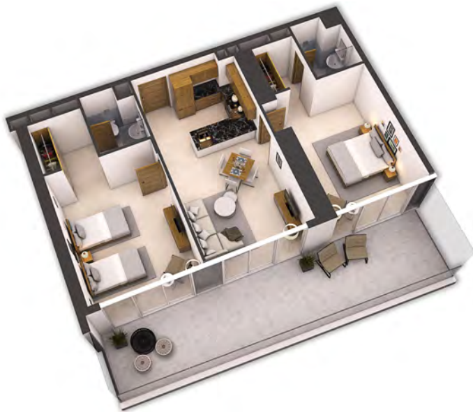
TOWER B 2 BEDROOMS