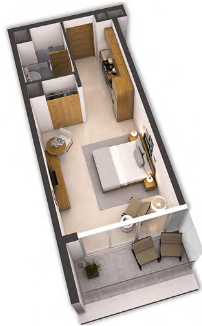
TOWER B STUDIO